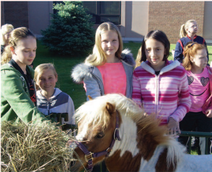
Elementary students meeting their Hawks High Flying Book Club special guest