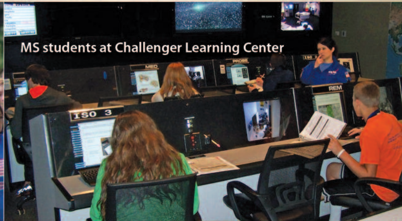
MS students at Challenger Learning Center