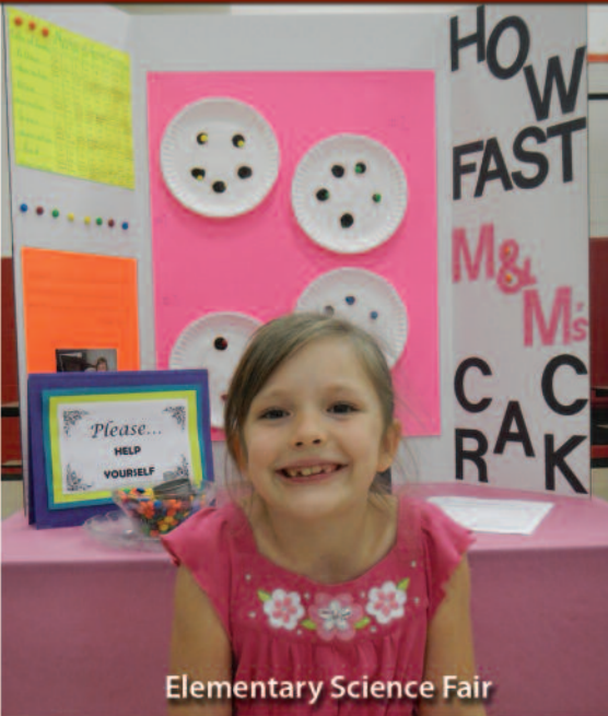
Elementary Science Fair