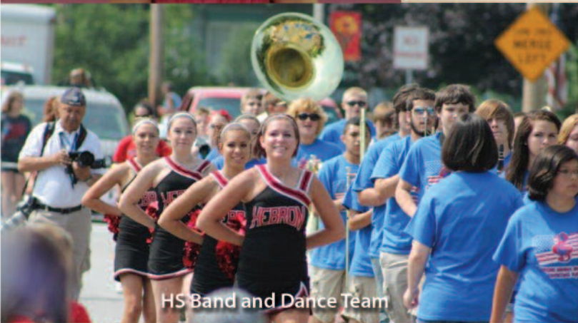
HS Band and Dance Team