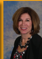
PRESENTER: Celebrate Hope, LLC.