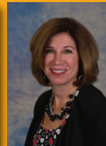
PRESENTER: Celebrate Hope, LLC.