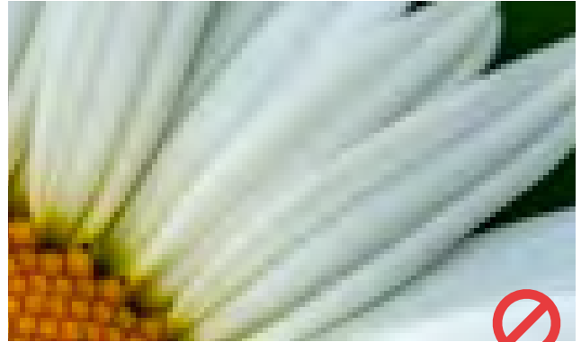
Low resolution (lost details) images