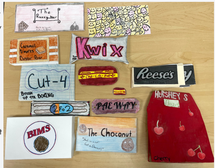
Hershey bar prototypes