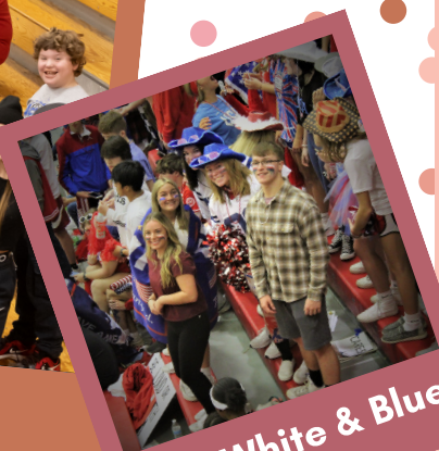
Red White & Blue