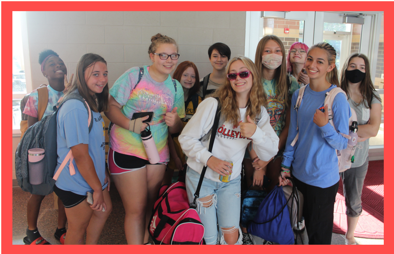
Pictured Above: (left to right)