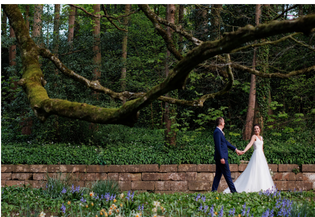
Prior Park Bath Grounds