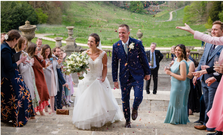
The Portico Steps