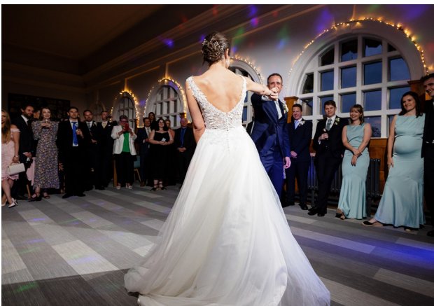
The Dining Hall