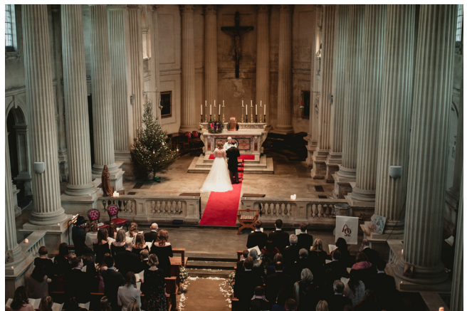
Our Lady of the Snows Chapel