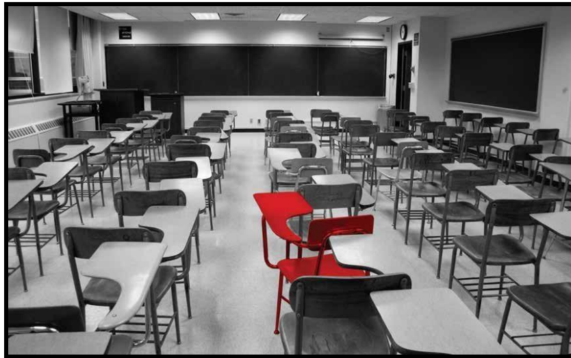
FR School Committee Approved 11.08.2021

Fall River Public Schools' goal is to ensure that every student attends school regularly and is actively engaged in their learning. Attending school regularly has a huge impact on a student's academic success and helps them feel better about school—and themselves. Families play a key role in building this habit from Pre-Kindergarten through 12th grade, so that students learn right away that going to school on time, every day, is important. Developing the skill of consistent attendance is something that will help students succeed in college and in the workplace.