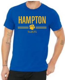
BELLA+CANVAS® Unisex Jersey Short Sleeve Tee Price: $17.99 Color Shown: True Royal Logo Shown: Paw Print Gold