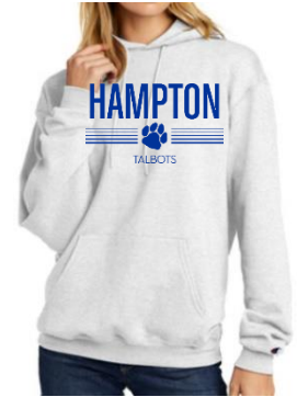
Champion • Powerblend® Pullover Hoodie Price: $34.99 Color Shown: Silver Grey Logo Shown: Paw Print Blue