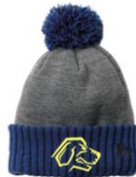
New Era • Colorblock Cuffed Beanie Price: $21.99