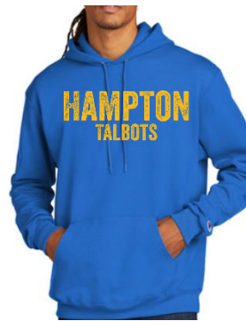
Champion® Powerblend® Pullover Hoodie Price: $34.99 Color Shown: Royal Blue Logo Shown: Faded Text Gold