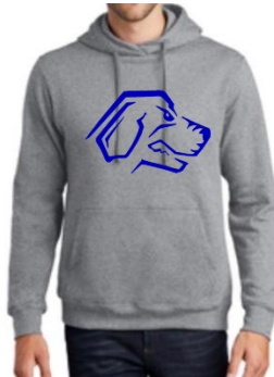
Port & Company® Fan Favorite™ Fleece Pullover Hooded Sweatshirt Price: $27.49 Color Shown: Athletic Heather Logo Shown: Dog Head Only Blue