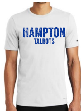
Nike Dri-FIT Cotton/Poly Tee Price: $29.99 Color Shown: White Logo Shown: Faded Text Blue