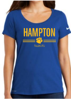
Nike Ladies Dri-FIT Cotton/Poly Scoop Neck Tee Price: $30.50 Color Shown: Rush Blue Logo Shown: Paw Print Gold