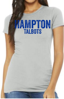
BELLA+CANVAS • Women's Slim Fit Tee Price: $17.99 Color Shown: Silver Logo Shown: Faded Text Blue