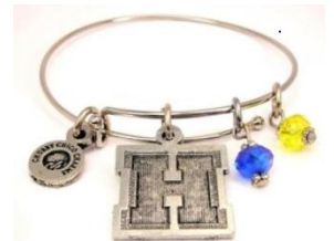
Hampton Charm Bracelet Price: $10.00