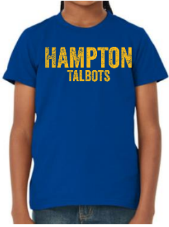
BELLA+CANVAS • Youth Jersey Short Sleeve Tee Price: $15.99 Color Shown: True Royal Logo Shown: Faded Text Gold