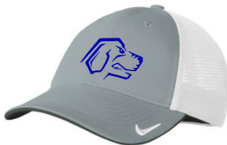
Nike Dri-FIT Mesh Back Cap Price: $27.00