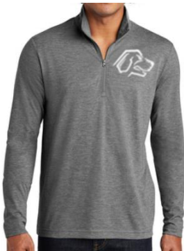
Sport-Tek® PosiCharge® Tri-Blend Wicking 1/4-Zip Pullover Price: $26.49 Color Shown: Dark Grey Heather Logo Shown: Dog Head Only White This is an EMBROIDERED ITEM!