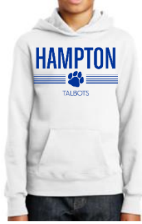
Port & Company Youth Fan Favorite Fleece Pullover Hooded Sweatshirt Price: $25.99 Color Shown: White Logo Shown: Paw Print Blue