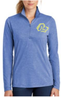
Sport-Tek • Ladies PosiCharge • Tri-Blend Wicking 1/4-Zip Pullover Price: $26.49 Color Shown: True Royal Heather Logo Shown: Dog Head Only Gold This is an EMBROIDERED ITEM!