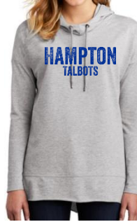
District • Women's Featherweight French Terry™ Hoodie Price: $25.99 Color Shown: Light Heather Gray Logo Shown: Faded Text Blue