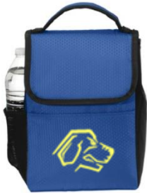
Port Authority® Lunch Bag Cooler Price: $16.99