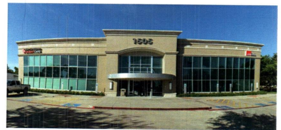
1505 Winding Way Drive