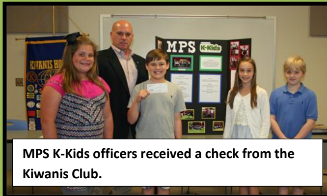
MPS K-Kids officers received a check from the Kiwanis Club.