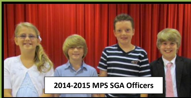
2014-2015 MPS SGA Officers