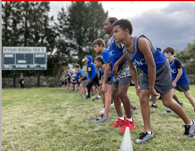
The ISAAC boys Cross Country team takes the starting line in a tri-meet along with BDJMS and Ledyard MS in October, 2021.