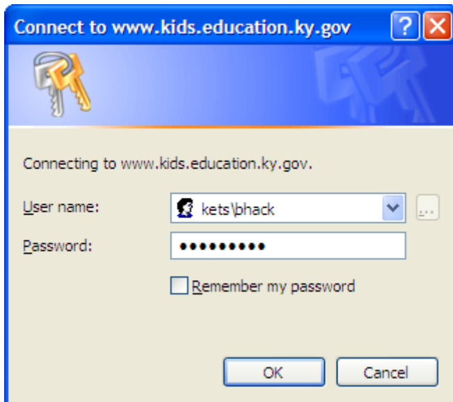
Figure 1 – Login to KSLDS website