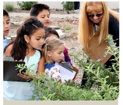
WHEN OUTDOORS Masks are optional for everyone