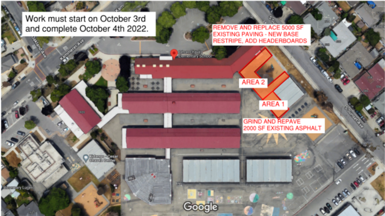
EXHIBIT C CESAR CHAVEZ ELEMENTARY SCHOOL SCOPE OF WORK