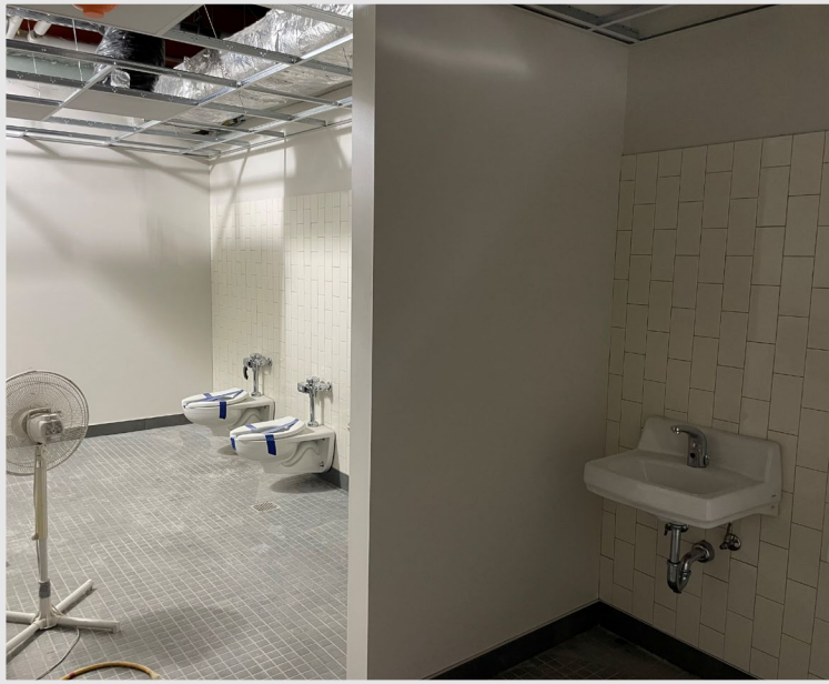
Bathroom tiling and fixtures were installed and ceiling tile will be installed next week