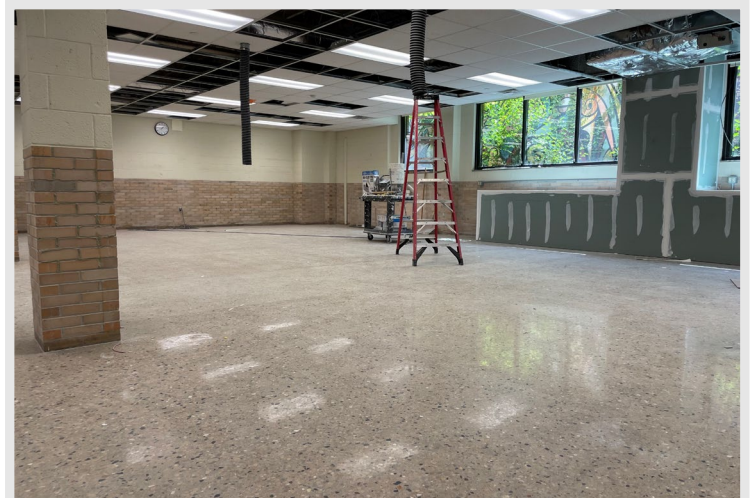
The polished concrete floor in the ceramics room is complete and the space is ready for final coats of paint