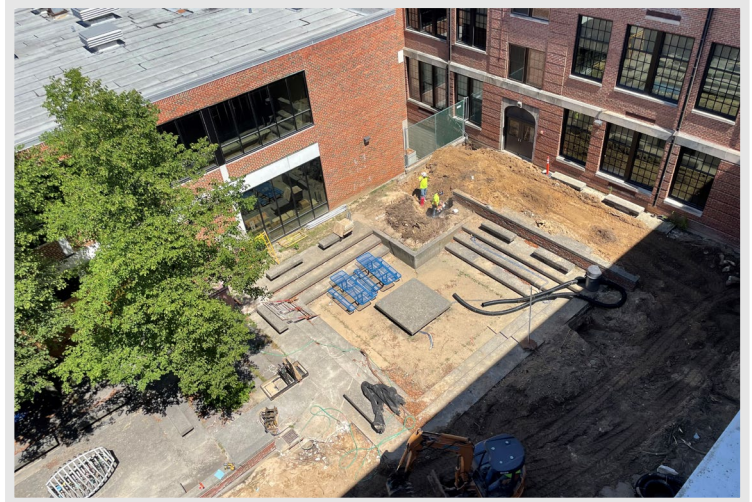
The interior courtyard is being excavated in preparation for concrete foundations that will support the new additions

The interior courtyard will include a connecting hallway from the theatre and pool areas to the new addition. Much of the onsite excavation and foundation work will occur in the upcoming weeks and crews will begin to install the structure using large cranes.