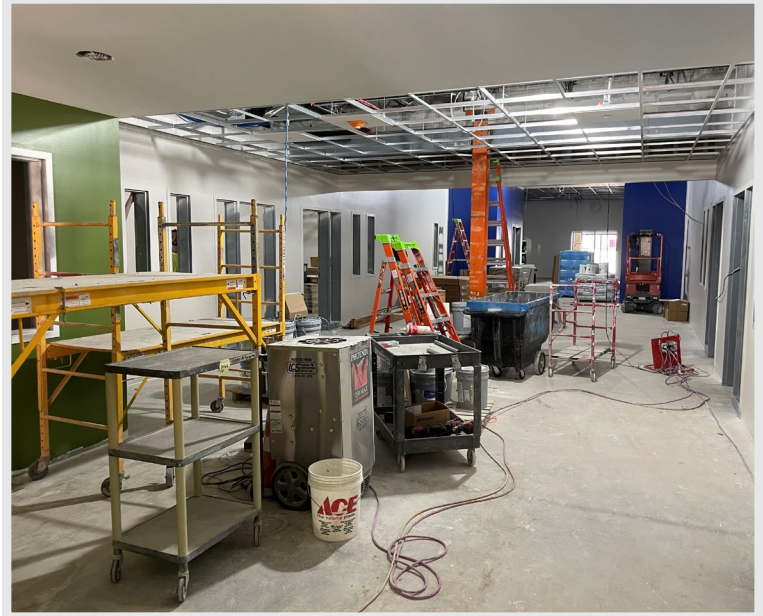
In the old gym area, workers painted the walls and installed the ceiling grid for the new classroom spaces, and will install the flooring next week