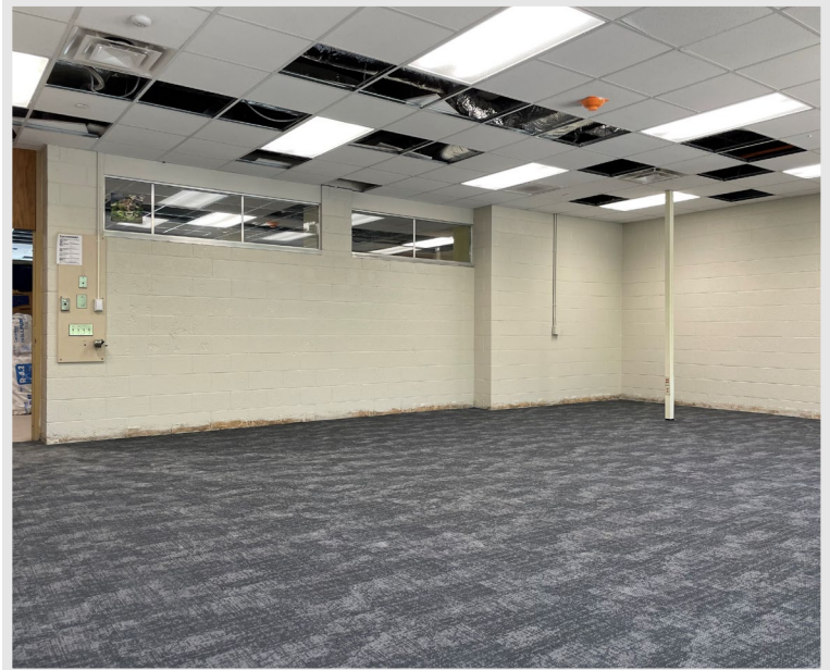
Walls are painted and flooring is installed in classrooms in the Van Hise wing

For additional information or questions, scan the QR CODE to be directed to the MMSD construction page.