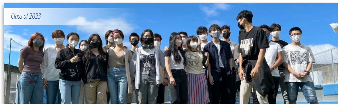
Class of 2023

The shared 'SOIS' campus means that OIS and SIS students can spend plenty of time together. PE, art, music classes and selected language options are shared by students from both schools, whilst the concert bands, orchestras and choirs, the sports teams, and student government are also drawn from students from both schools. This creates a rich and stimulating learning environment for students from both schools.