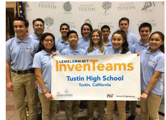
THS 2017 Lemelson-MIT InvenTeam