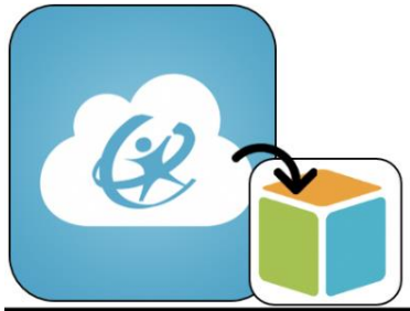
(Classlink opens iReady)