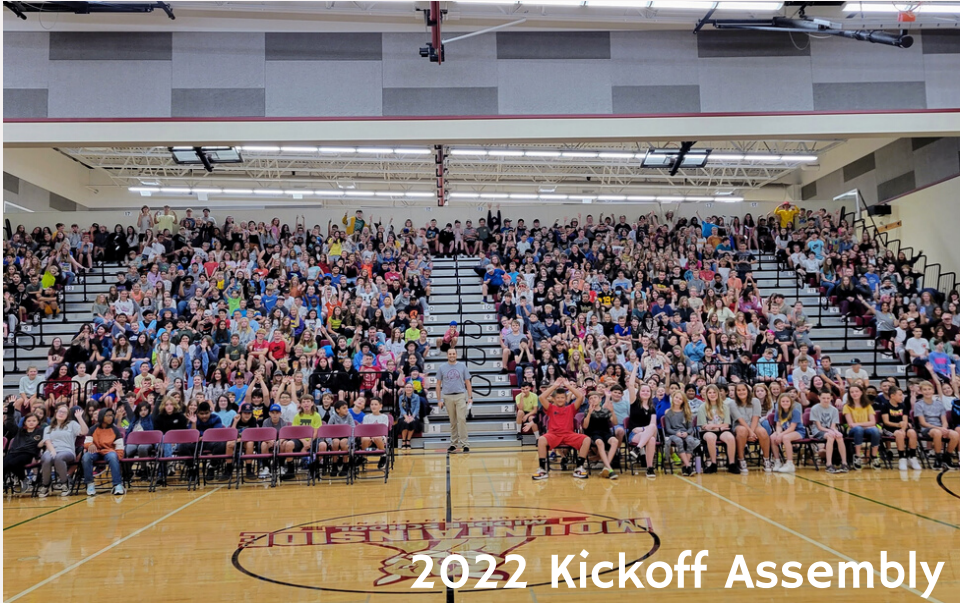
2022 Kickoff Assembly