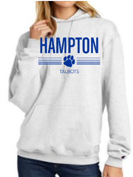
Champion • Powerblend® Pullover Hoodie Price: $34.99 Color Shown: Silver Grey Logo Shown: Paw Print Blue