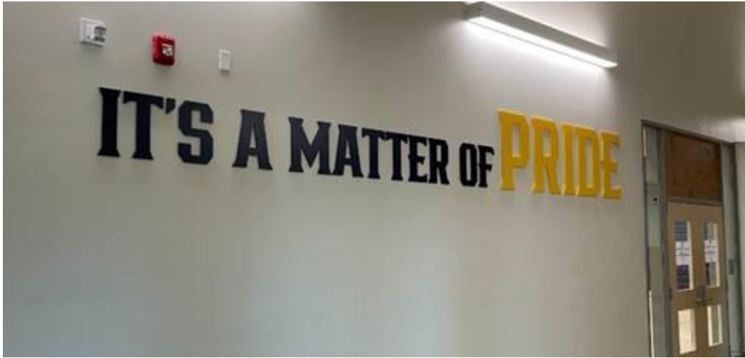
Signage installed at the main entrance into the new gym