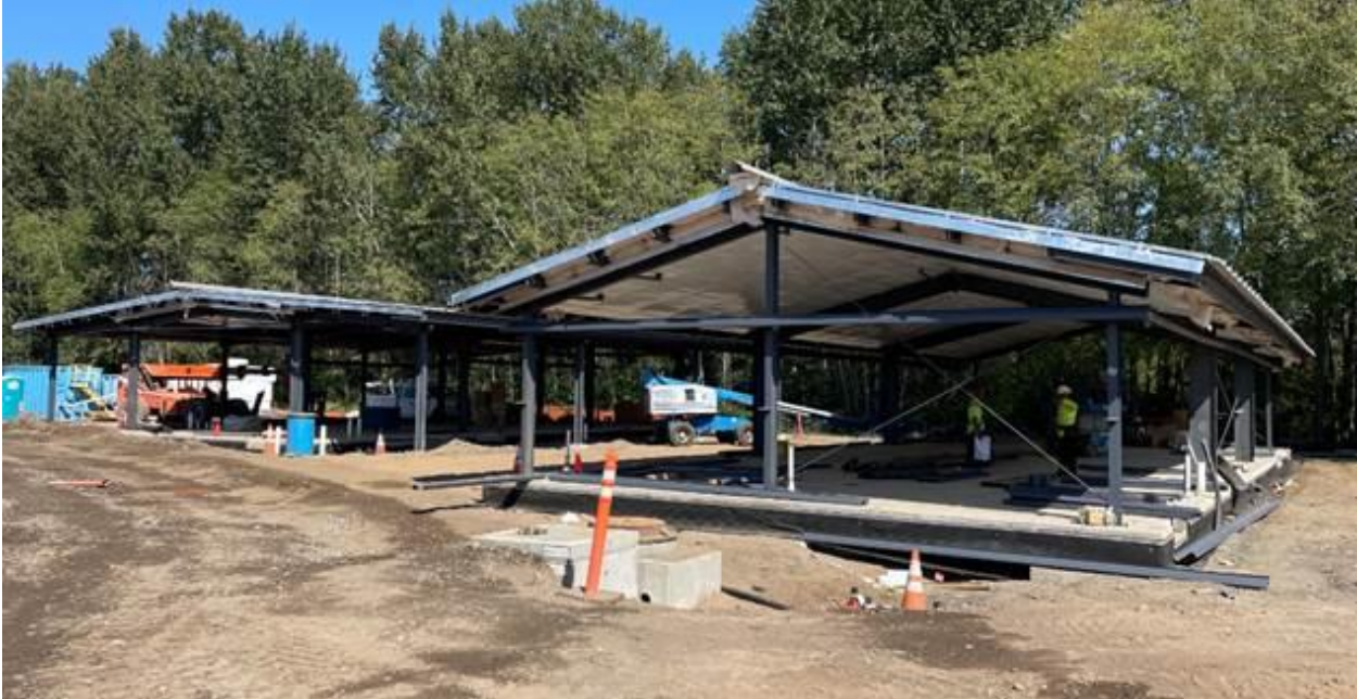
Completed roofing at the Agricultural Science and Aquaculture buildings