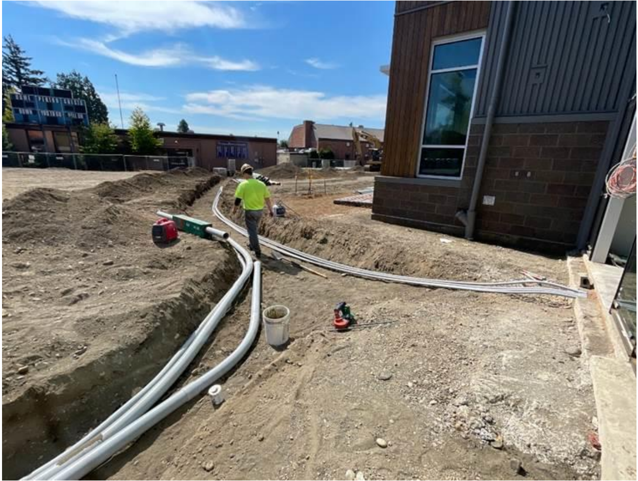
Underground piping installation in preparation for the new staff parking lot on the south side of the Academic Wing