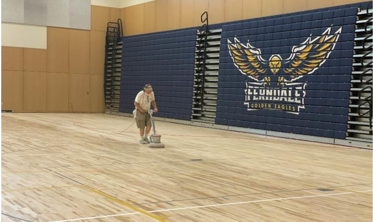
Final touch-ups before the final Main Gym floor finish