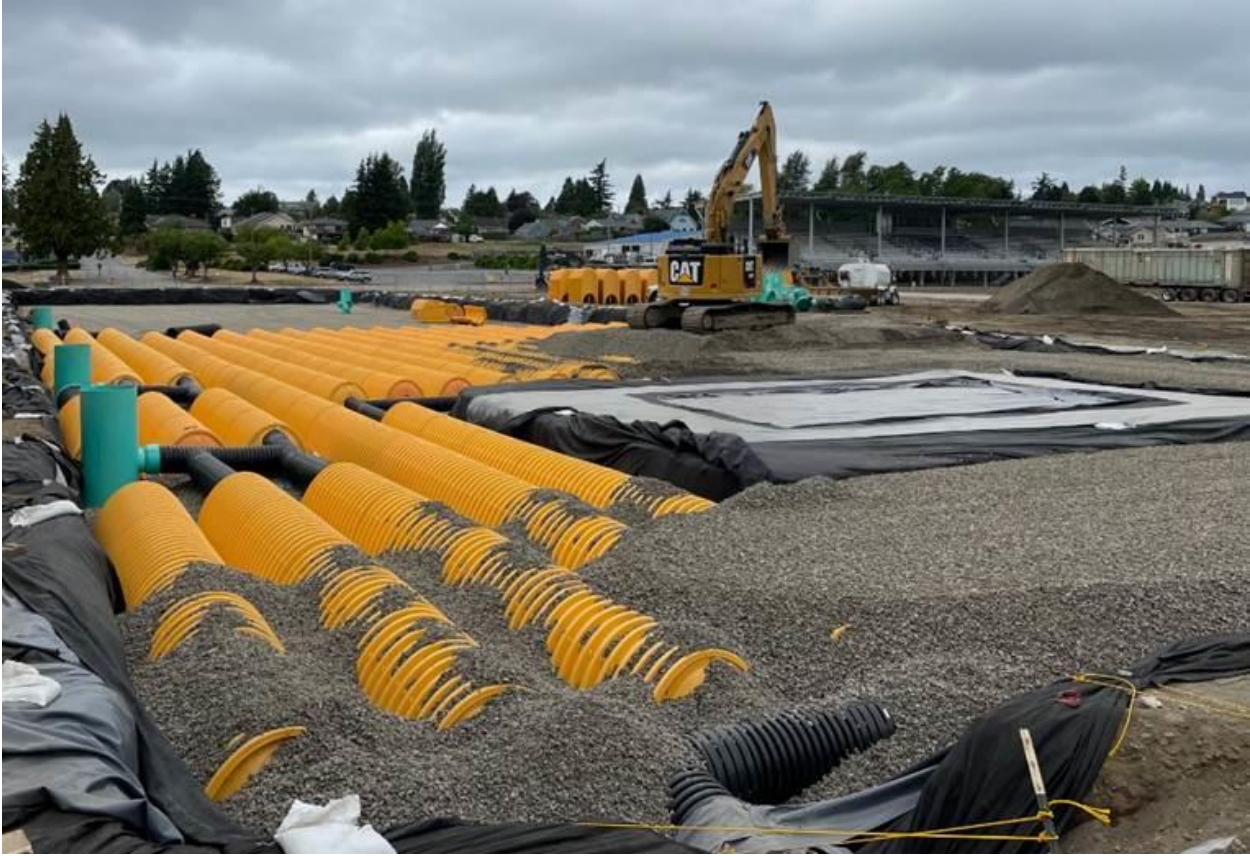
Stormwater detention arch installation north of the new gym