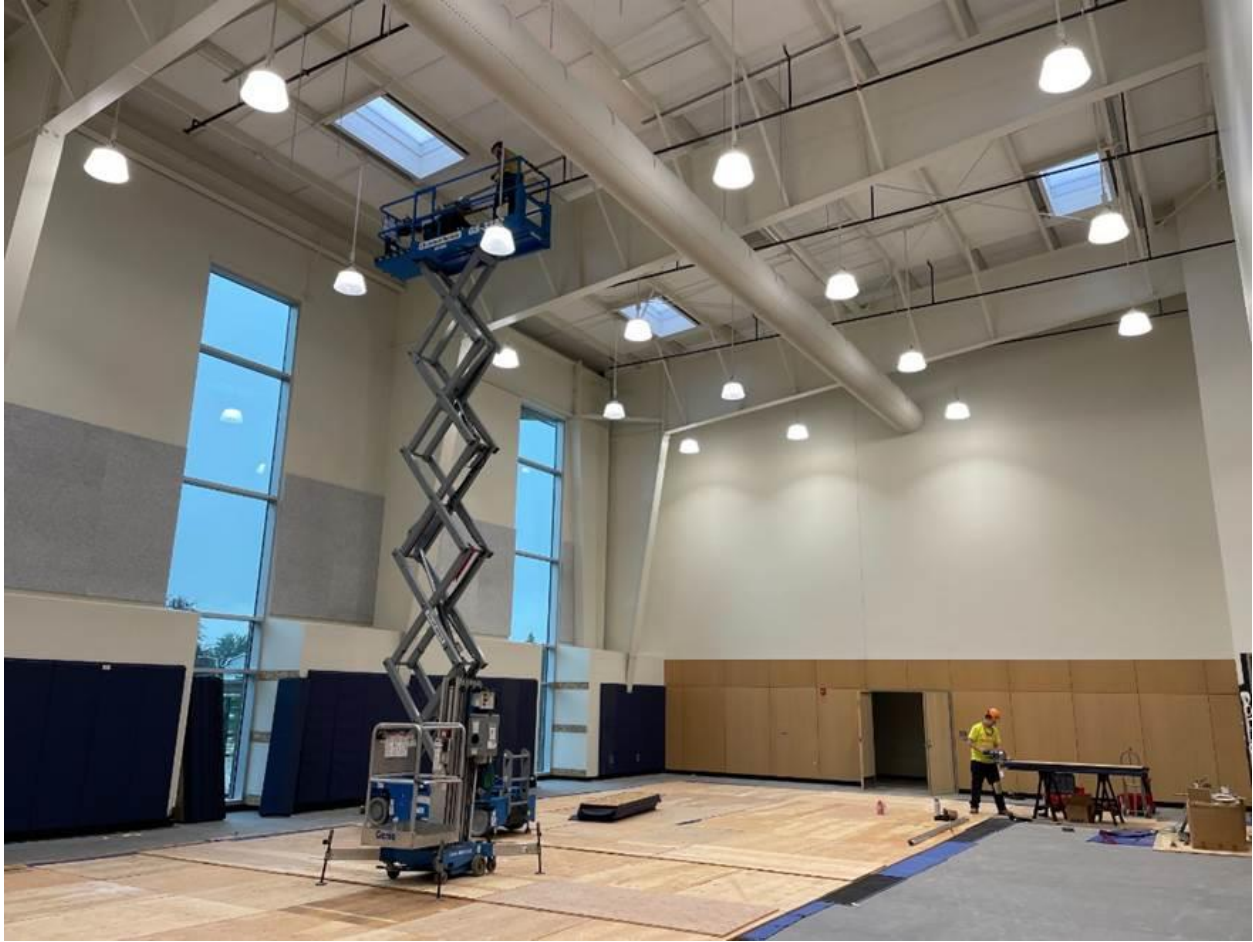
Crews getting started installing batting cages in the P.E. Room