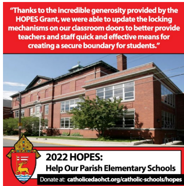
Social Media Post 2 Post on Sept. 7, 2022