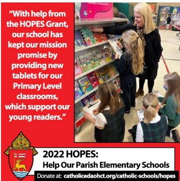
Social Media Post 4 Post on Sept. 16, 2022