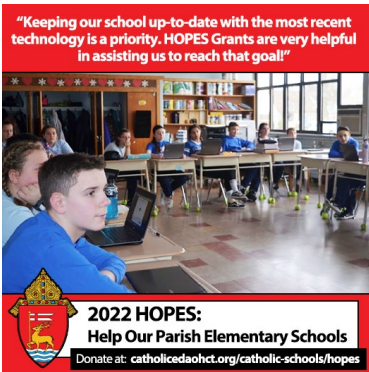
Social Media Post 1 Post on Sept. 2, 2022

**The HOPES social media photos in the campaign calendar below have been provided to you as separate photos that can be uploaded to each of your school's social media platforms. Copy for each post is also provided below!**