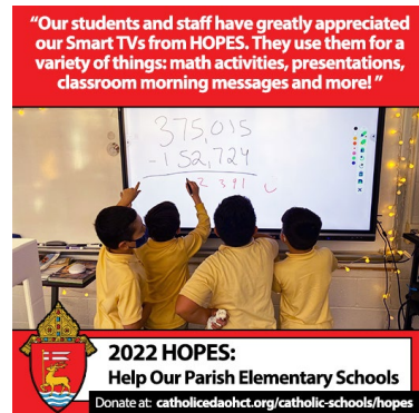
Social Media Post 6 Post on Sept. 23, 2022