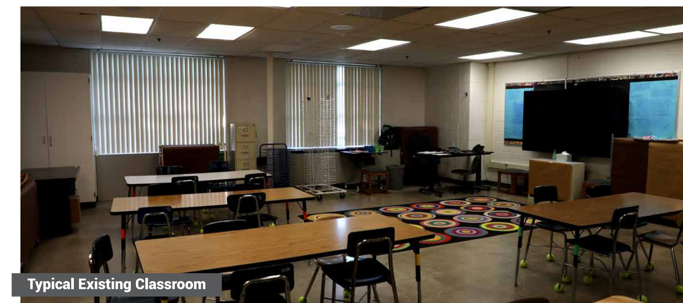
Typical Existing Classroom