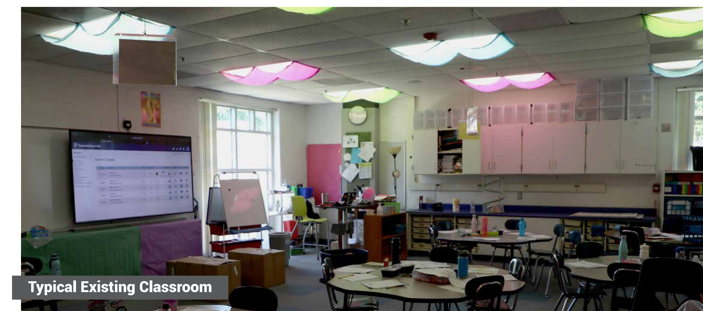
Typical Existing Classroom