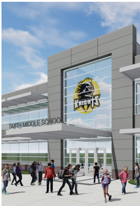
Artist's rendering of entrance at new Smith Middle School