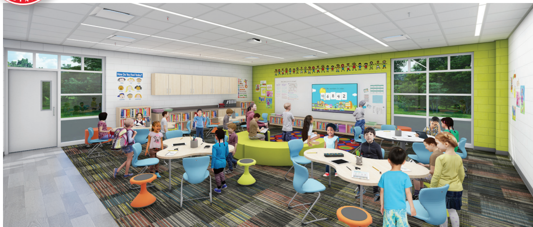
Artist's rendering of new elementary classroom