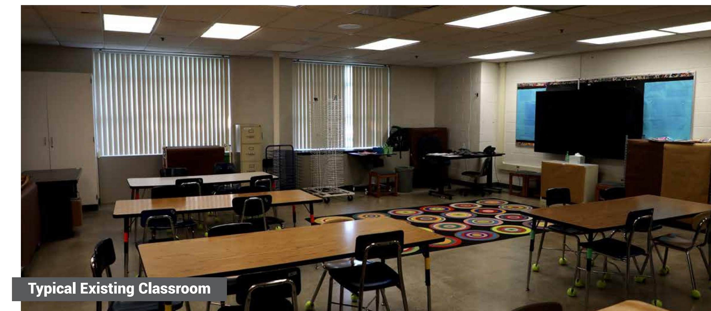
Typical Existing Classroom