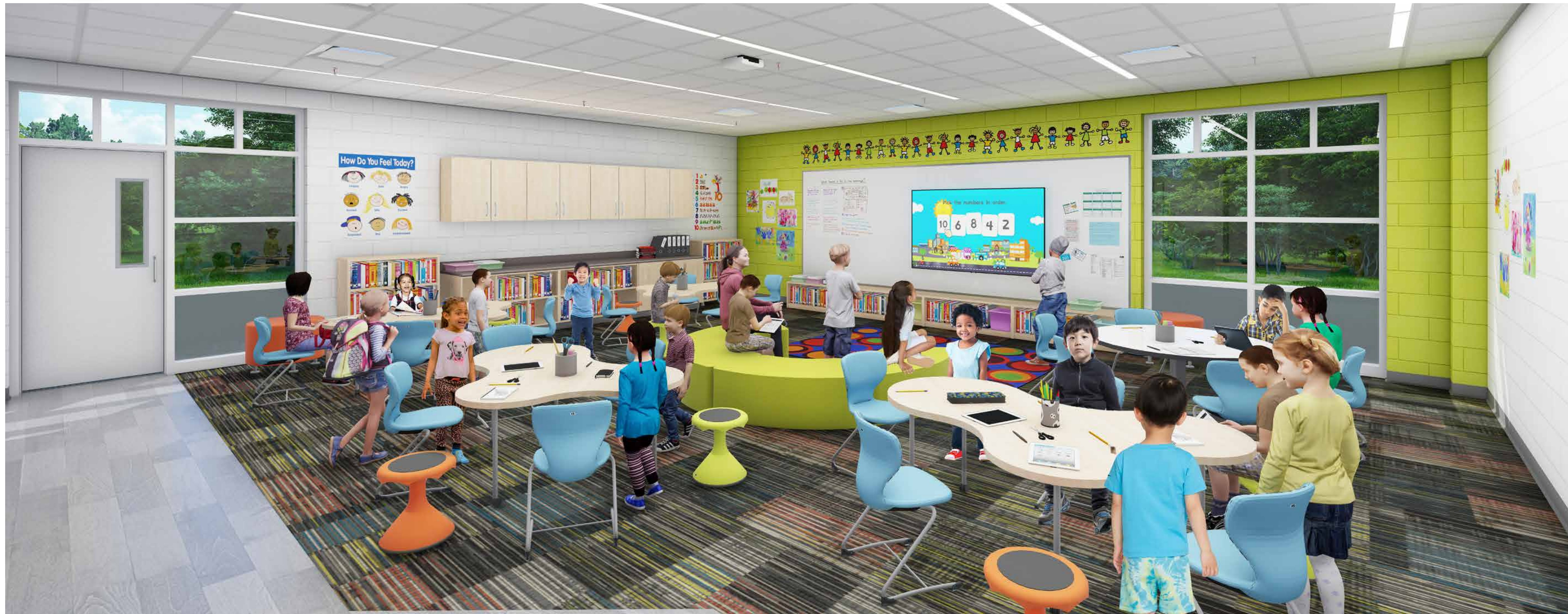
Artist's rendering of new elementary classroom