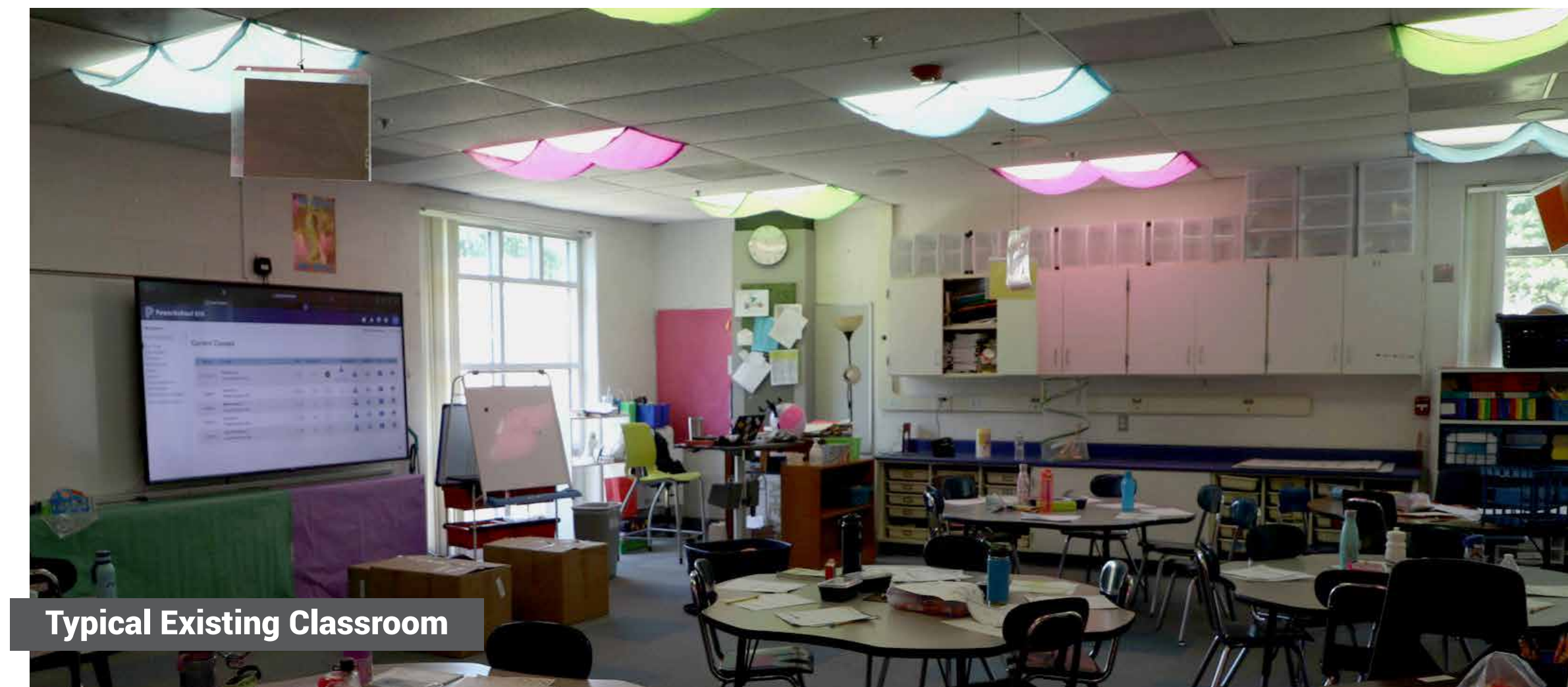
Typical Existing Classroom