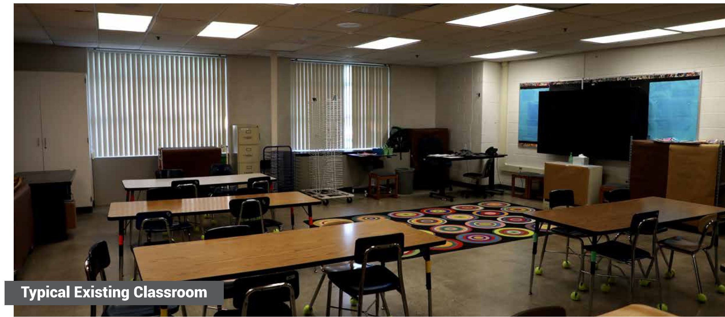
Typical Existing Classroom