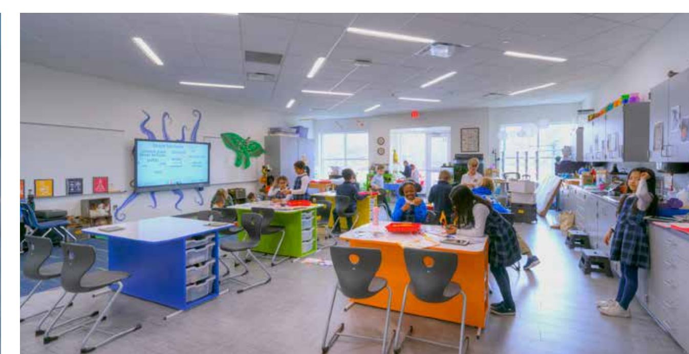
Pictures depict spaces that could be achieved in Bond 2022