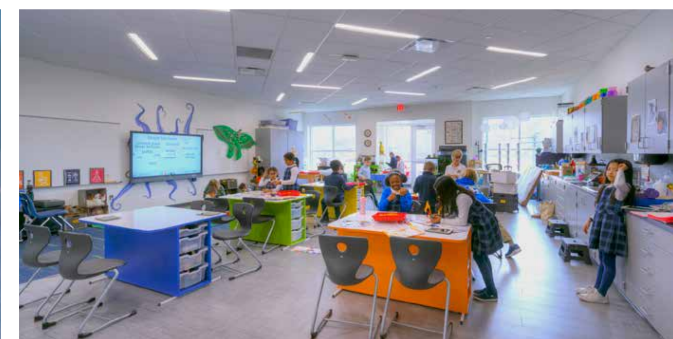
Pictures depict spaces that could be achieved in Bond 2022