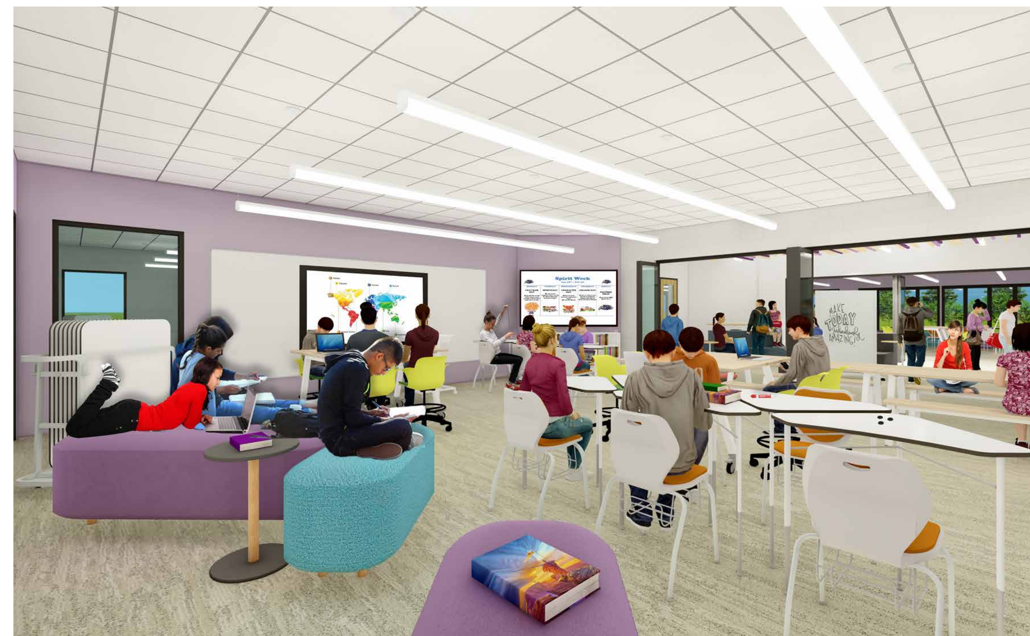
Artist's renderings of new classroom/collaboration spaces at Boulan Park Middle School