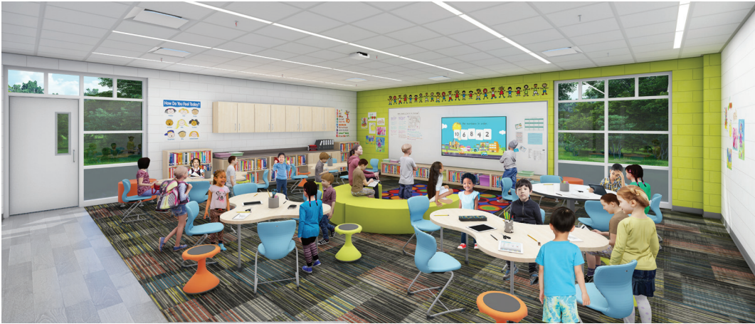
Artist's rendering of new elementary classroom