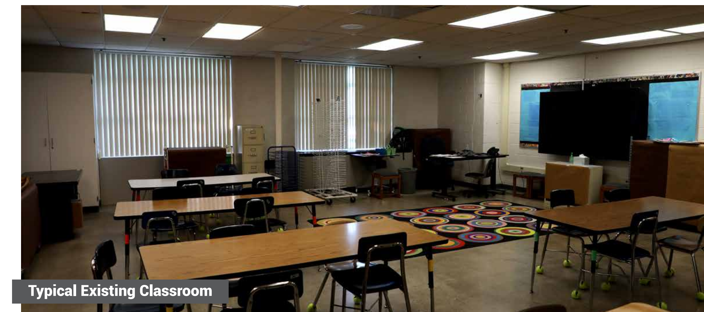
Typical Existing Classroom