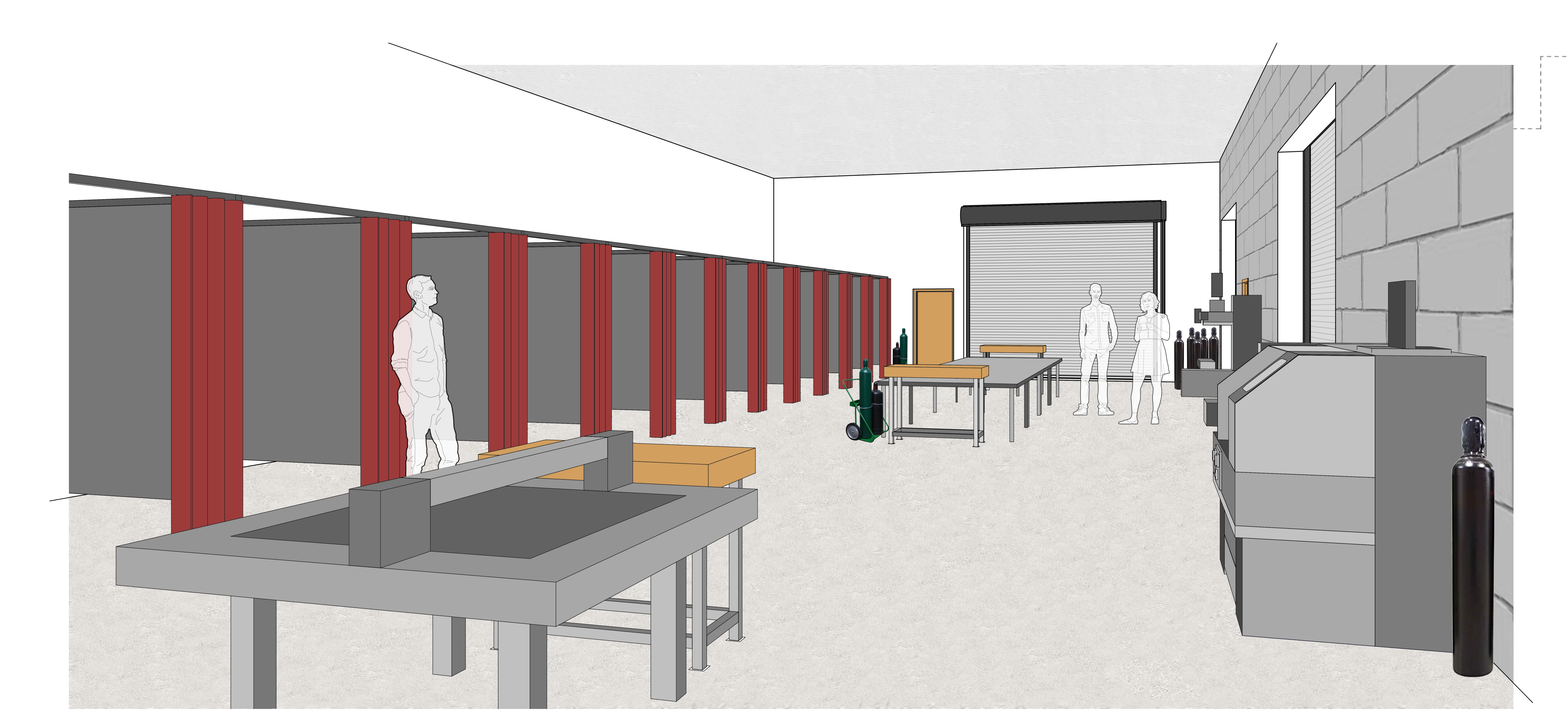
INTERIOR WELDING LAB