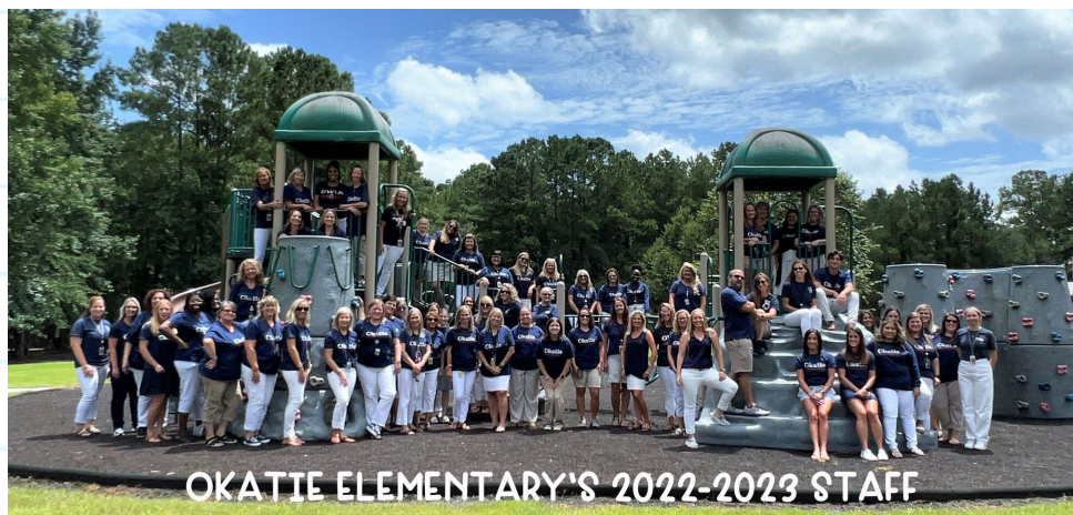
OKATIE ELEMENTARY'S 2022-2023 STAFF