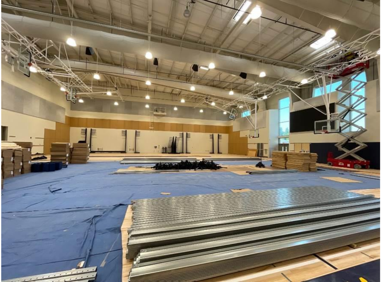
Bleacher installation in the Main Gym