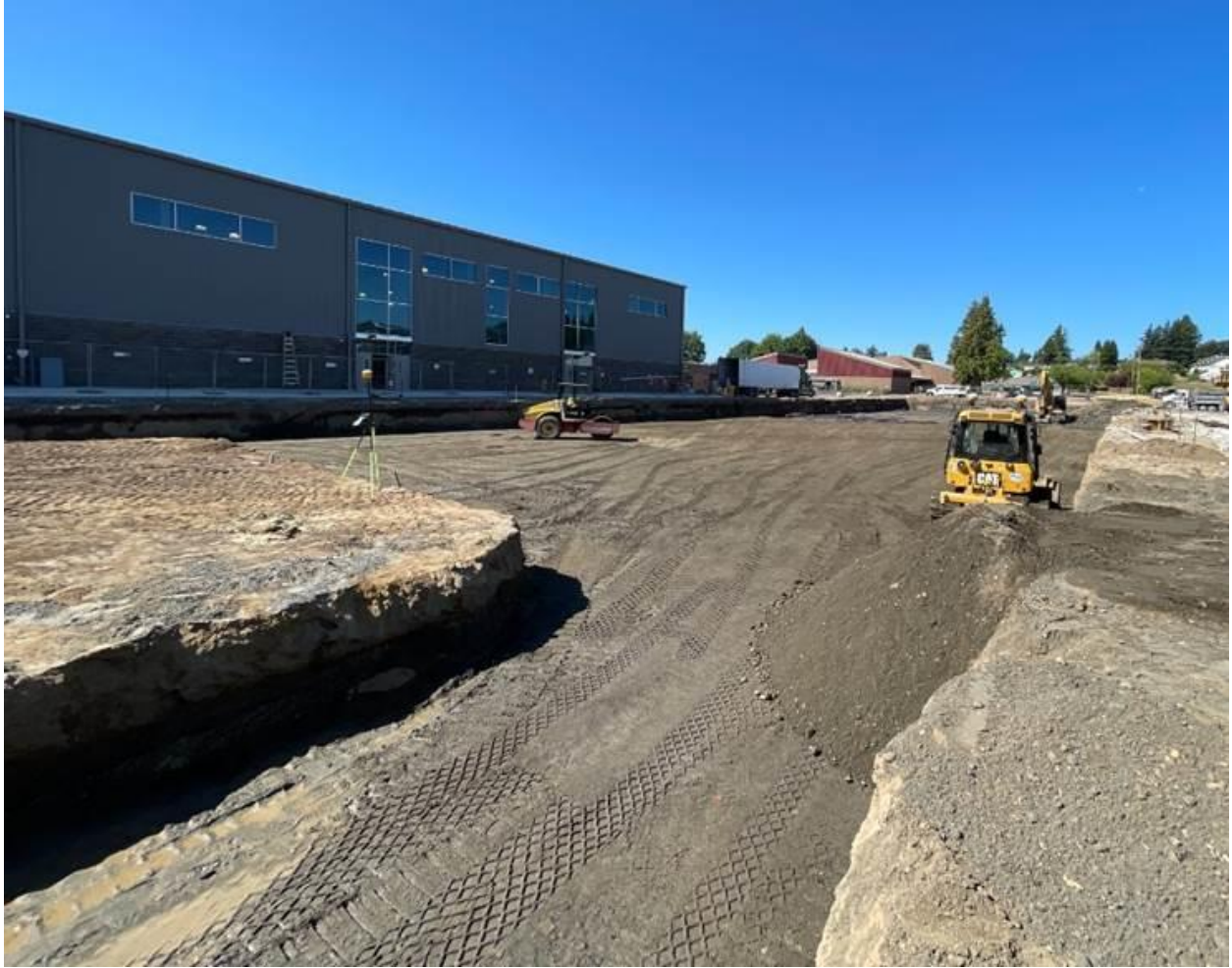
Underwater stormwater detention system excavation on the north side of the Athletic Wing