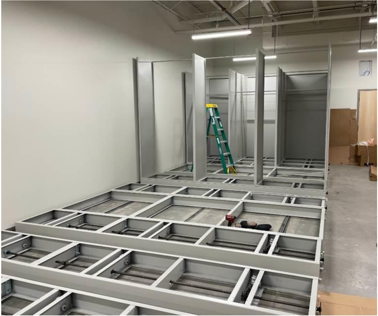
High-density sports equipment storage system being assembled