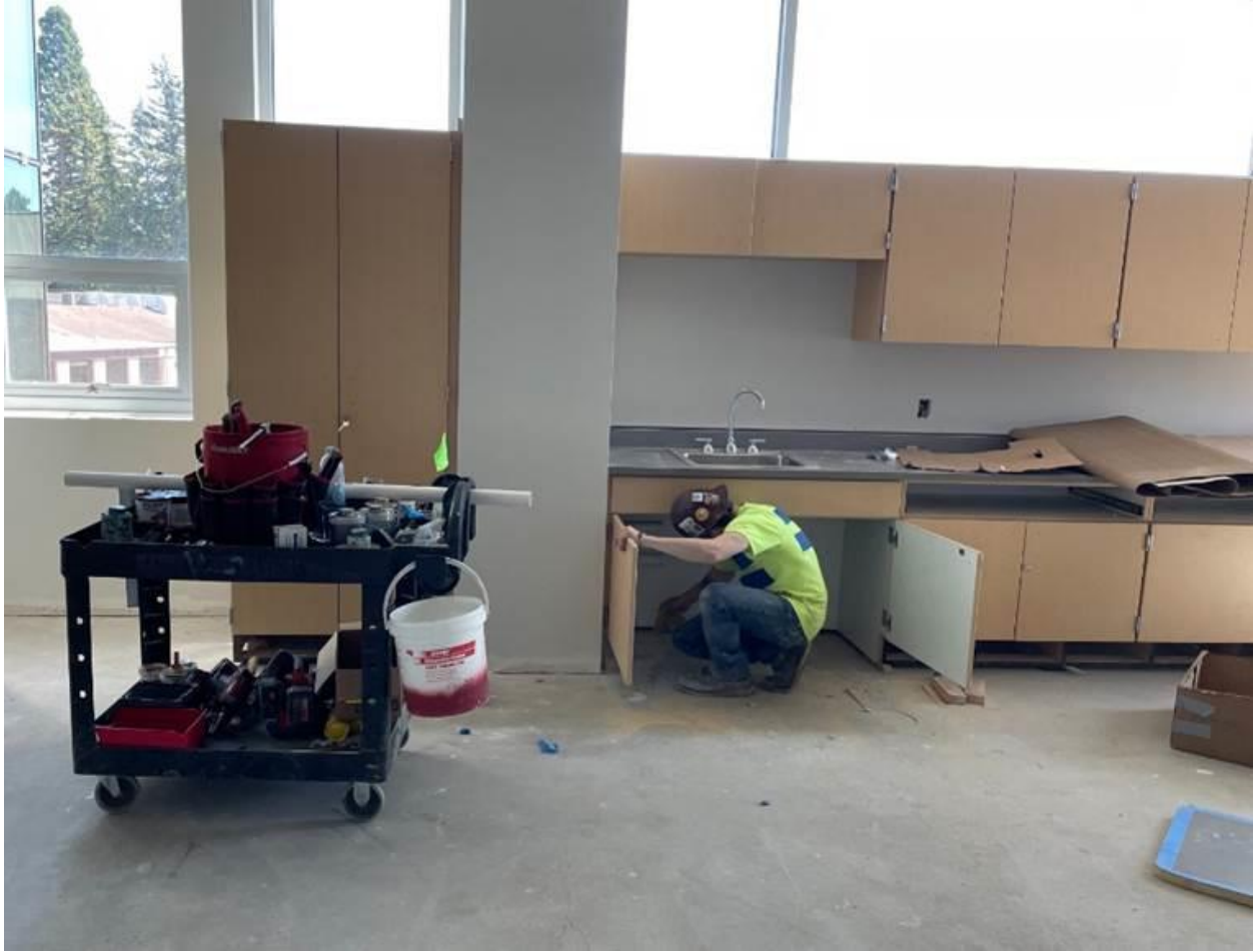
Cabinet installation in the Academic Wing