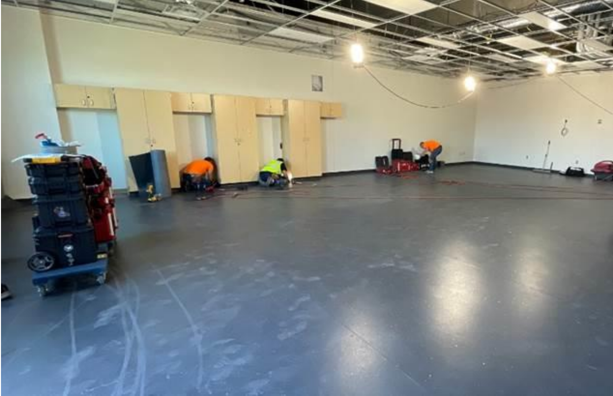
Finished flooring in the sports medicine room