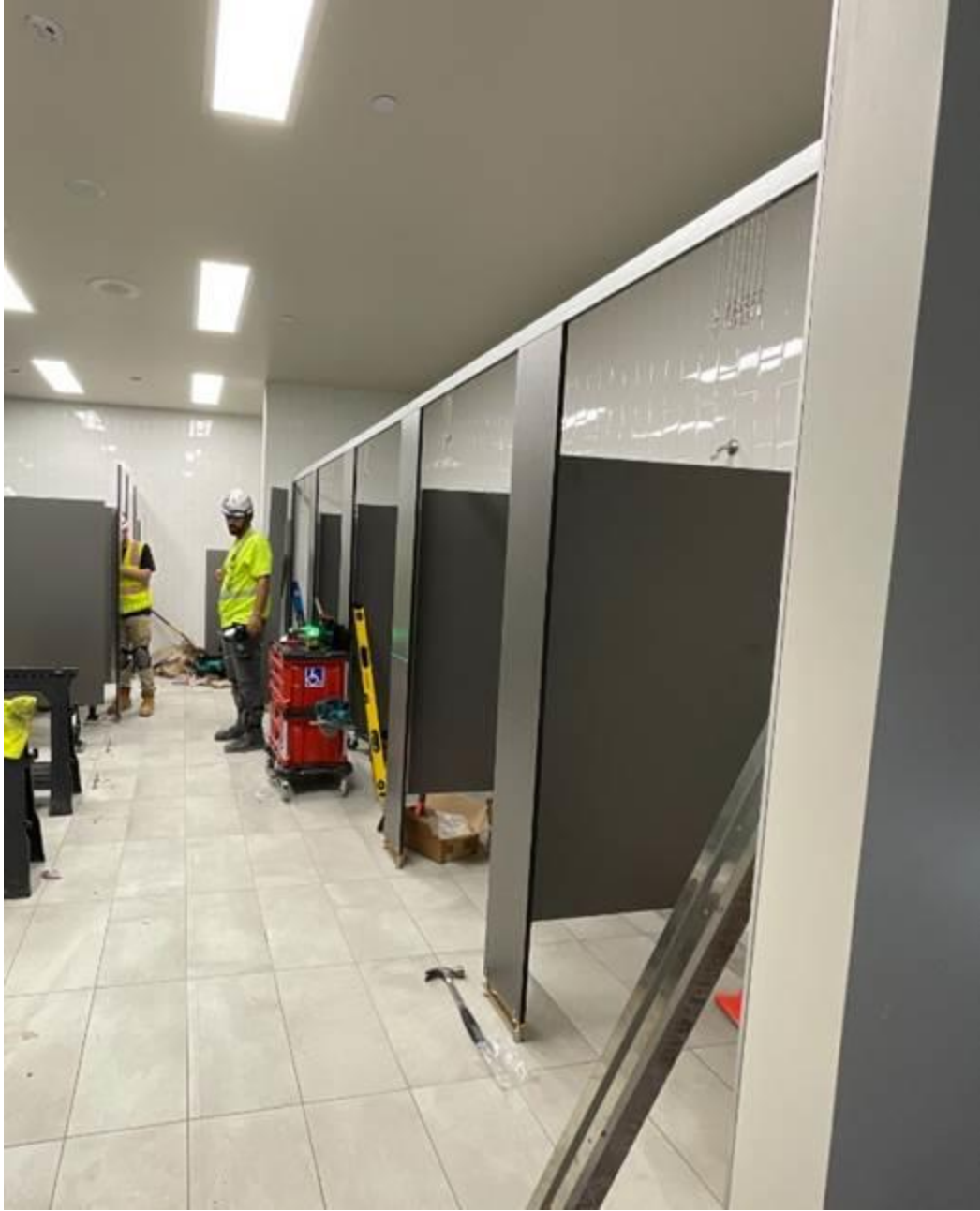
Bathroom stall installation in the locker room