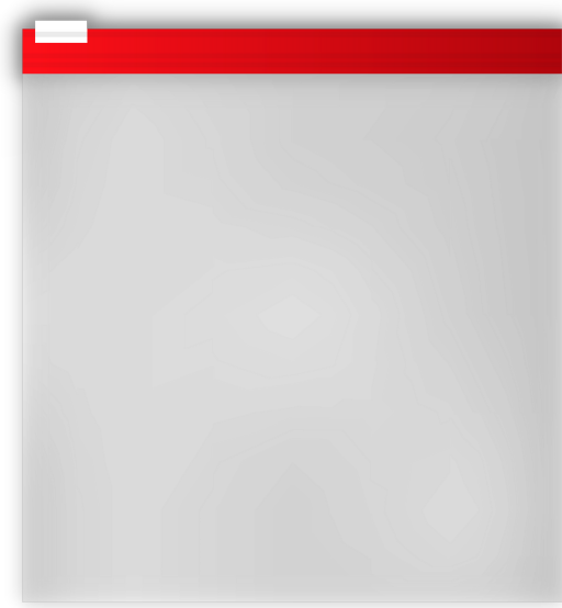
PLASTIC STORAGE BAG One gallon, re-sealable, clear One bag per person