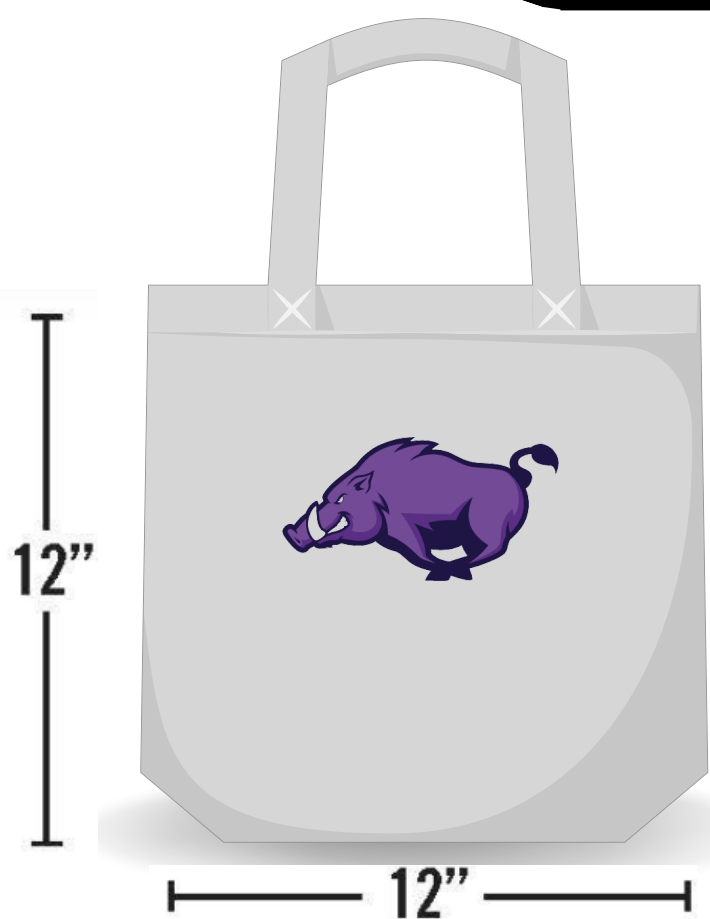
CLEAR TOTE 12" x 6" x 12" One bag per person