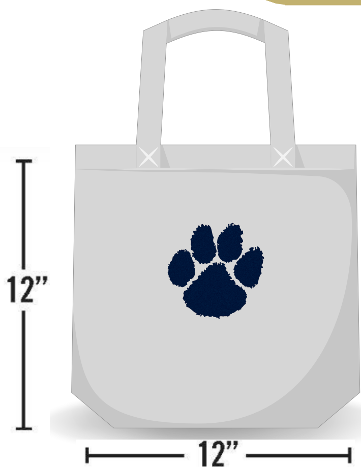
CLEAR TOTE 12" x 6" x 12" One bag per person