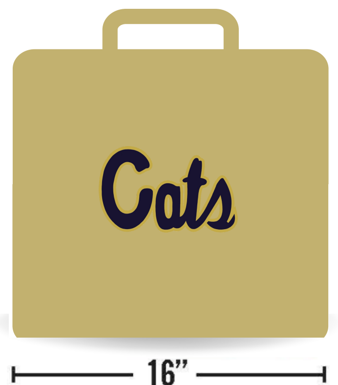
SEAT CUSHION Includes seat cushion w/ back No arms or pockets allowed No larger than 16" wide