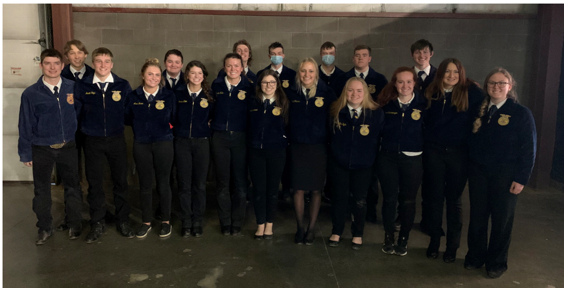
The other picture is the group of members who attended and participated at the State FFA Convention.