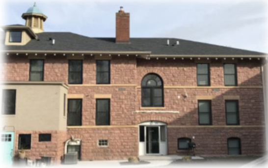
The Moucka and Valnes Homes 100 W 10th St. Units 8 AND 9