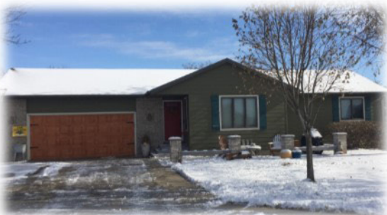
The Thoreson Home 104 Johnstone Circle