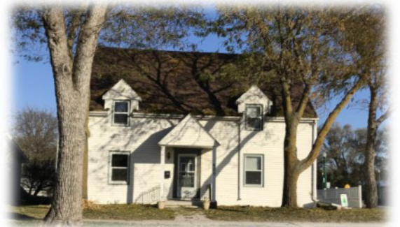
The Fritz Home 400 State Ave.

Refreshments Served at the Dell Rapids Museum