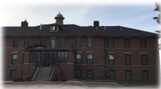
The Jaros Home 100 W 10th St. Unit 6