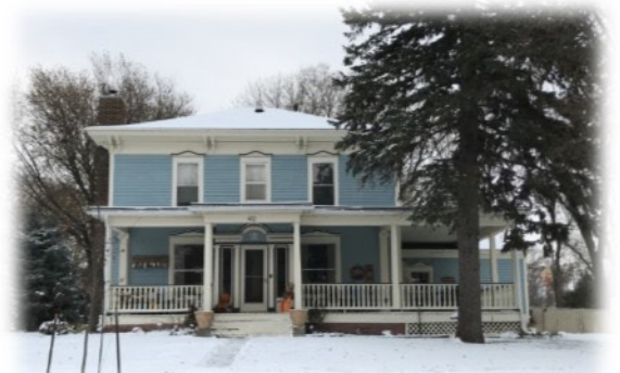
The Anderson Home 412 N Garfield Ave.