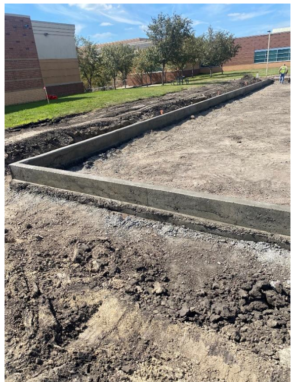
Forms pulled to reveal new curbing