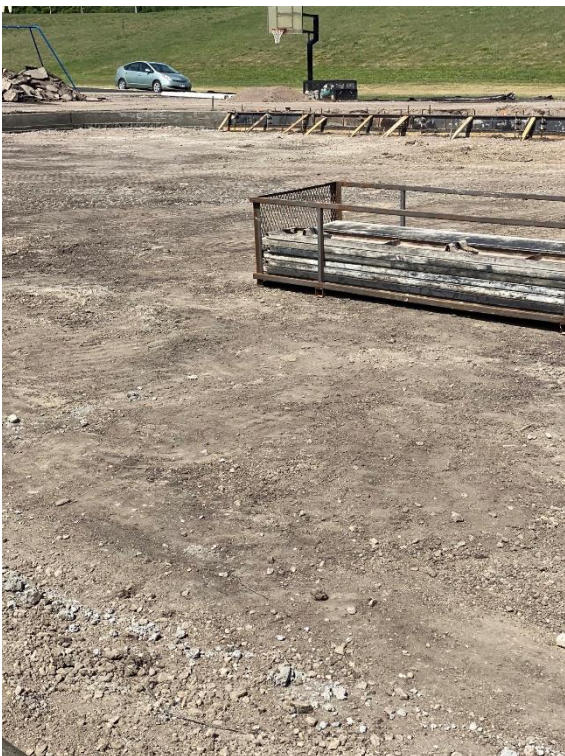
Forms Installed to set new concrete curb surrounding relocated playground