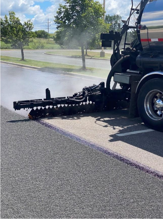
1 st layer of seal coat being applied in the HS parking lot