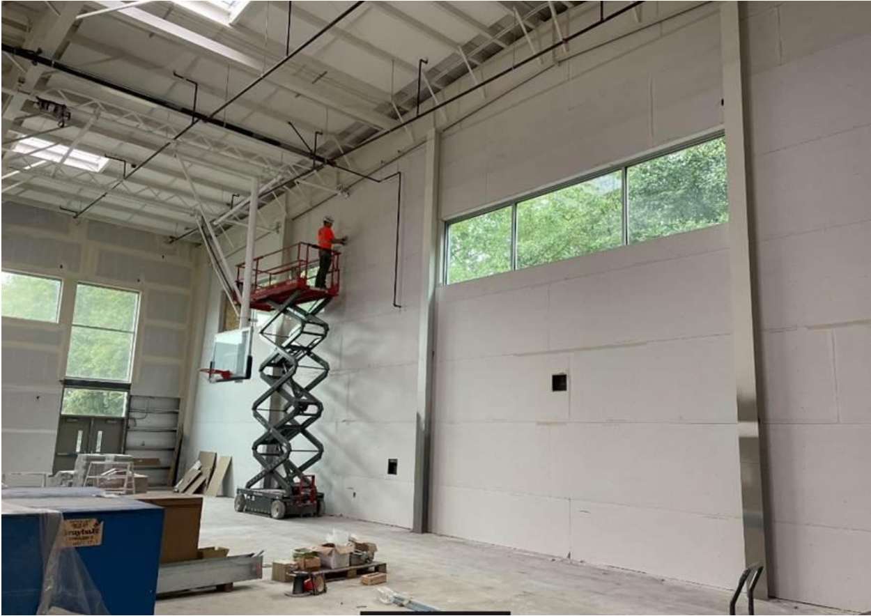
Auxiliary Gym wallboard in progress

Concrete floor grinding and polishing in the corridor between the new gym and the P.E. room