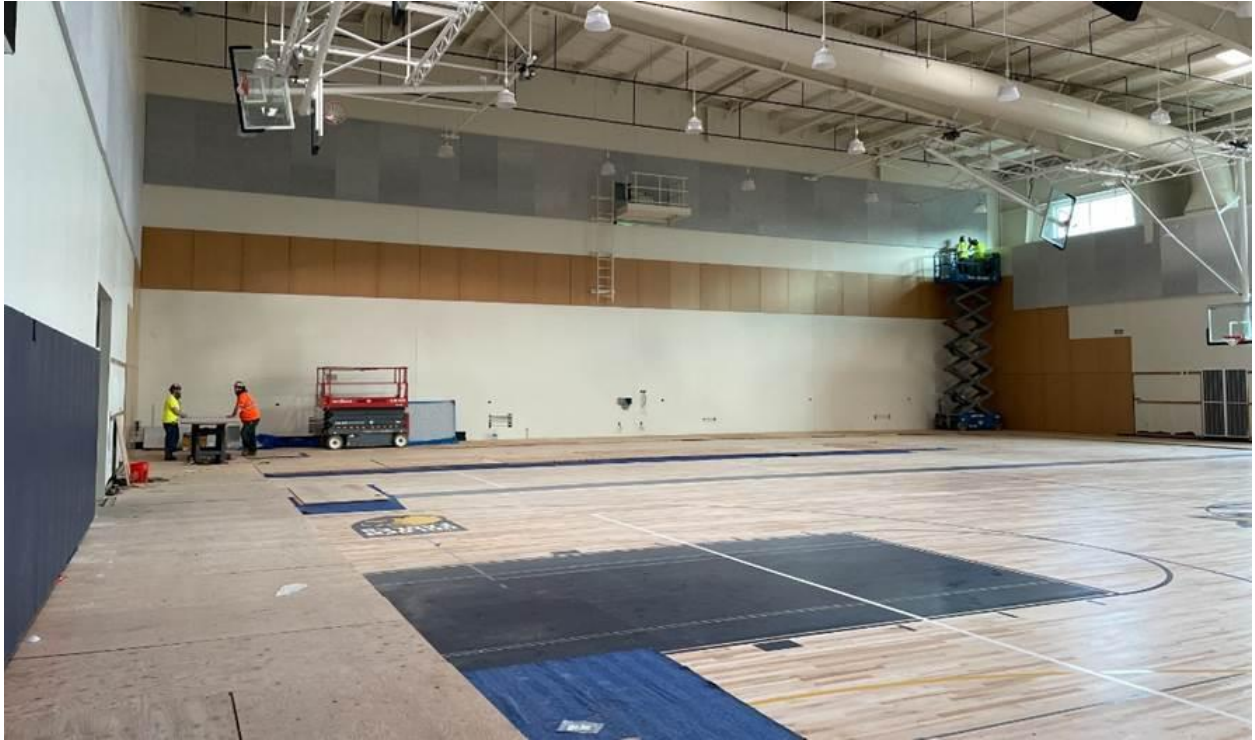
Wall padding, paneling and soundboard in the new gym. The large uncovered spot is where the new bleachers will go.