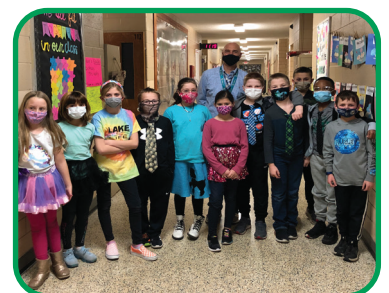
Right: 2/2/22 - Tutus, Ties, and Tennis shoes