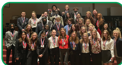
Top left to right: Black History Month, EH Spark Awards, HS Mock Trial Team