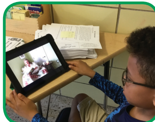
A student tunes in on the iPad.