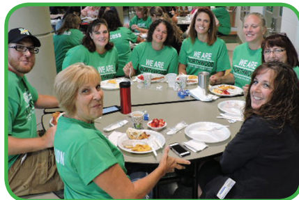
Members of Northwood's staff enjoying breakfast together on staff opening day.

Community members are invited to come visit our buildings and see the amazing things our students are doing while enjoying a FREE breakfast!