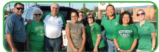
Northmont Board of Education Members and Administrators preparing to walk in the Homecoming Parade.

⚡ Homecoming Dance - Saturday, October 14, 8:00 at the Thunderdome - Ticket information will be available on the High School web page.