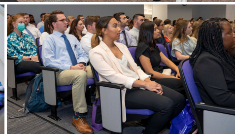
Medical students in the Class of 2026 participated in orientation activities to usher in the start of the semester.