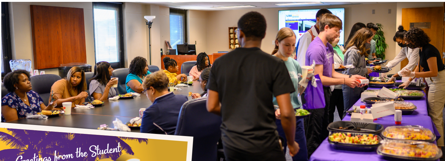
Students and staff enjoy lunch during the Open House hosted by Student Financial Aid to showcase the new Student Oasis space.