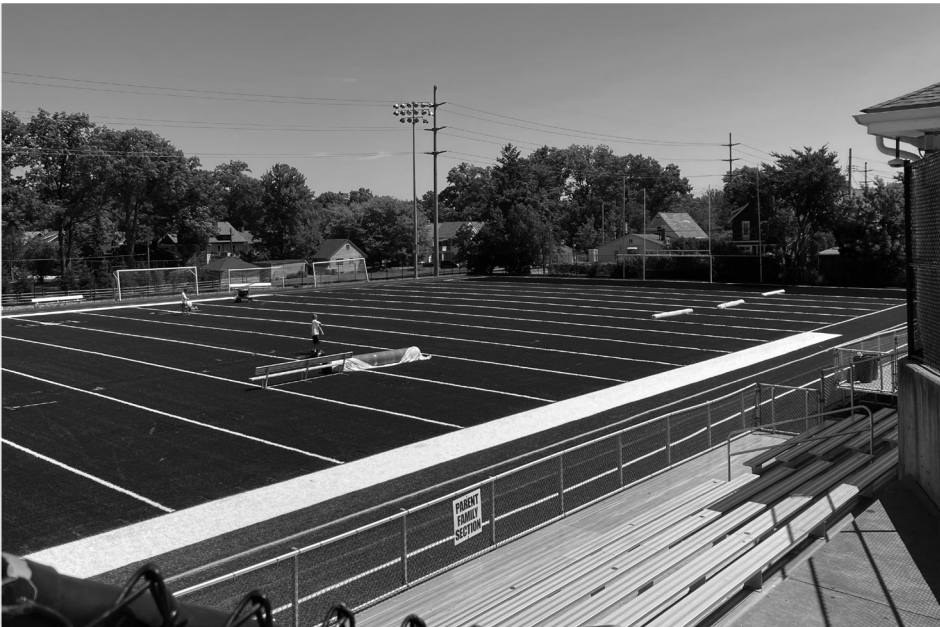
New turf being installed at Garfield Middle School field.