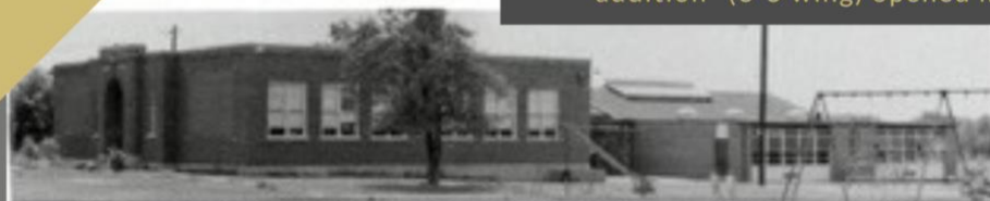
1961 - TROY UNION ELEMENTARY SCHOOL - 1962 TROY, MICHIGAN

Our current building opened in 1921. The "new addition" (3-5 wing) opened in 1971.