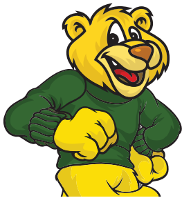
THOMPSON ELEMENTARY SCHOOL

Muli is the only typeface assigned for use on the web. It is the default font on our website template and should never be changed without prior, written approval from the District Webmaster.