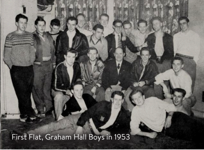
First Flat, Graham Hall Boys in 1953