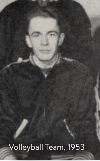
Volleyball Team, 1953